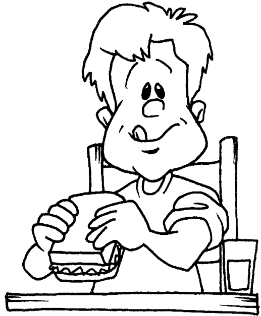
Color and cut out the picture. Paste it below.